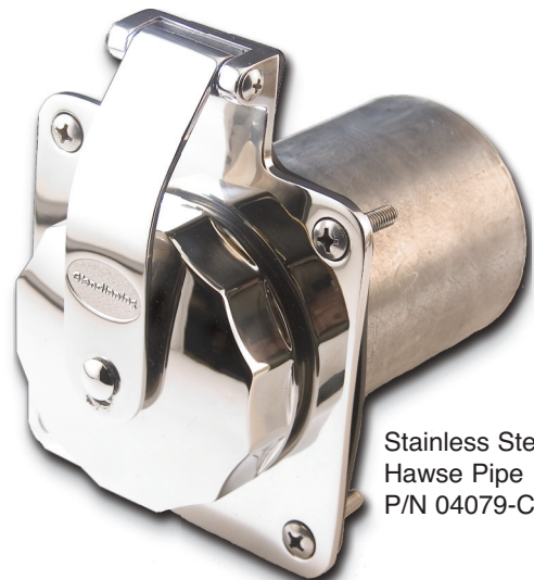
Stainless Steel Hawse Pipe P/N 04079-CRM

● HAWSE PIPE FOR CORD EXIT — provides a watertight exit for the power cord through the bulkhead. Various styles and types are available from plastic to stainless steel.